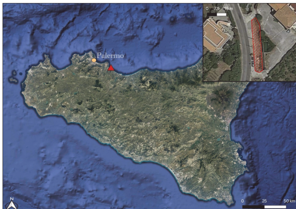
Fig. 1. Distribution map of L. purpureus in Sicily.